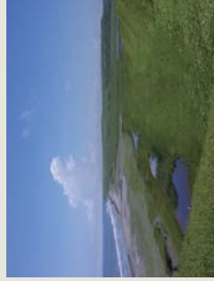
The hill overlooking the Pacific

Of the three routes, Bettoga route is remarkable since this is the only route with a breathtaking view of the ocean and presence of alpine plants.