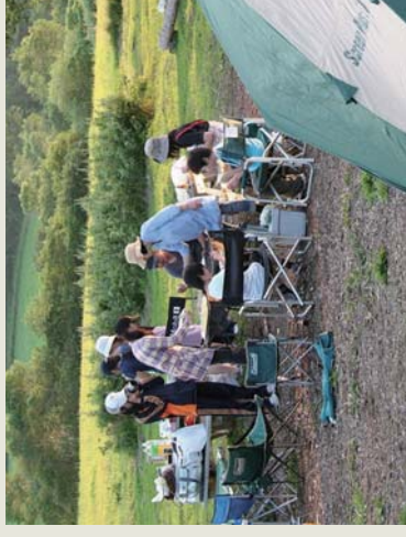
Tick-Tack Camp Ground