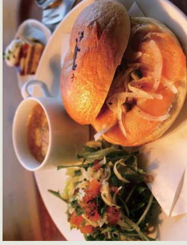
Dairy Restaurant Grassy Hill

Grassy Hill dairy restaurant within Ito Farm on the Attko Route offers dishes that specialize in the use of Hokkaido produce, such as beef stew and cheese doria, as well as desserts made by patissiers, milk and original soft served ice cream. Also on sale are cow motif goods and authentic feeding bottles for calves. Accommodation (camping) is also available at the Tick-Tack Camp Ground within Tomioka Farm on the Hattaushi Route. The area surrounding "Kuttara" hands-on experience center for processing agricultural products is also available for pitching tents, as well as baking homemade pizzas in the pizza oven and enjoying barbecues. In addition, accommodations such as hotels and guesthouses are available in Nemuro City.