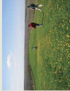
Mono-omoi ni Fukeru Oka (literally translated "a hill to be lost in deep thoughts")

On the Attko pasture route, you can look back in time to the days of the pioneers, by visiting the old horse path and the old train line.